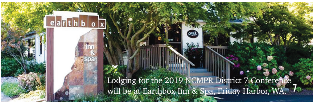
Lodging for the 2019 NCMPR District 7 Conference will be at Earthbox Inn & Spa, Friday Harbor, WA. 7